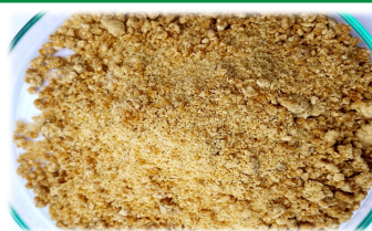
Powder Jaggery Processing from Sugarcane Juice