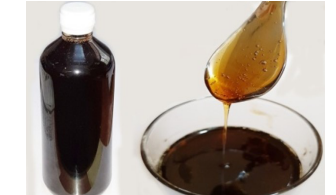
Liquid Jaggery Process