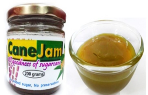
Cane Jam Production