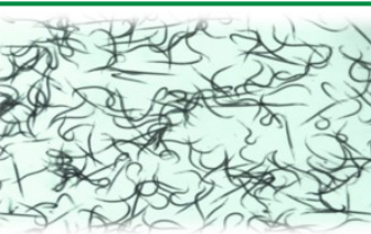
EPN Biopesticide Formulation