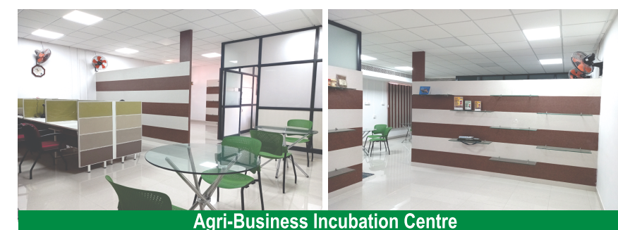
Agri-Business Incubation Centre