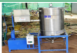
Sett Treatment Device (STD)