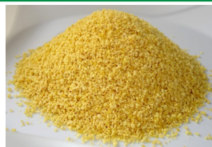
Freeze Dried Sugarcane Juice