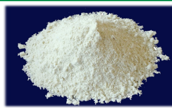
Production of Spray Dried Sugarcane Juice