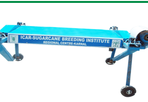
Quatro Sugarcane Single Bud Cutter