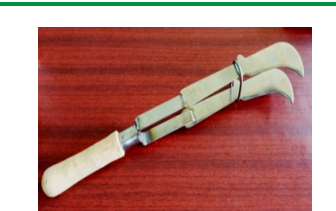
Sugarcane Detrashing Tool