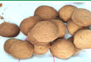
Production of Cane Dietary Fibre Food Products