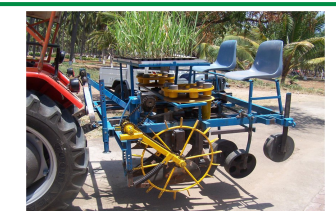
Sugarcane Mechanical Planter