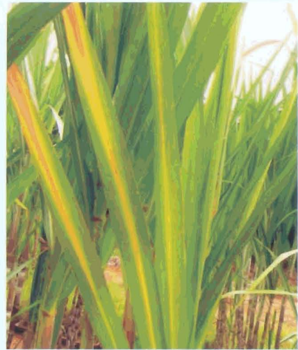
Fig.3. Drying of discoloured laminar region from leaf tip downwards along the mid rib

Like grassy shoot phytoplasmas here also the causative virus or phytoplasmas are confined to phloem tissues of sugarcane. When disease-infected setts are planted, disease readily spreads to the new crop from the setts. We have found that planting of infected setts results in cent per cent expression of the disease in the field. Build up of high virus titre in most susceptible varieties causes drying of all canes by 10-12 months. Secondary