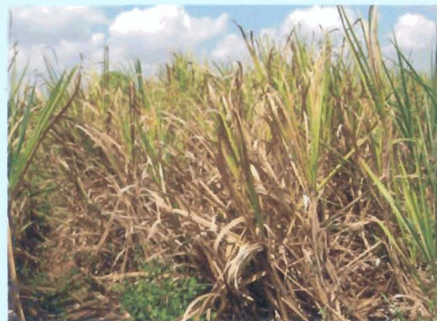
Fig.5. Premature drying of foliage in sugarcane field due to severe YLD

Although the crop with mild symptoms record normal cane growth in the plant crop, ratoons from such fields show severe disease and ultimately cane yield reduced. In case of severe infections, cane thickness and stalk height are significantly reduced. The diseased crop always record reduced cane yield due to retardation of cane thickness and height. Although the number of internodes is same in the infected plant as in the healthy plant they are shorter and lighter in weight. Fresh weights of comparable internodes of the infected plants are only 20-65% the weight of healthy plants. It is estimated that severe infection of the disease reduces cane yield by 30 to 50 % and sugar yield is reduced significantly in the mills. Since the loss caused by the disease is phenomenal in the field as well as in the mills, efforts should be made to reduce the disease severity and sustain sugarcane productivity.