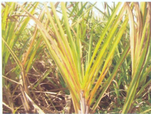
Fig. 4. YLD infected sugarcane exhibiting typical mid rib yellowing/drying and bunching of leaves in the crown.

Before the clear-cut establishment of etiology and epidemiology, it has been reported that part of YLD symptom expression could be related to