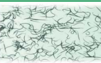
EPN Biopesticide Formulation