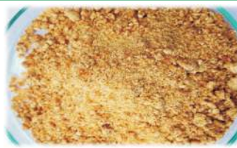
Powder Jaggery Processing from Sugarcane Juice