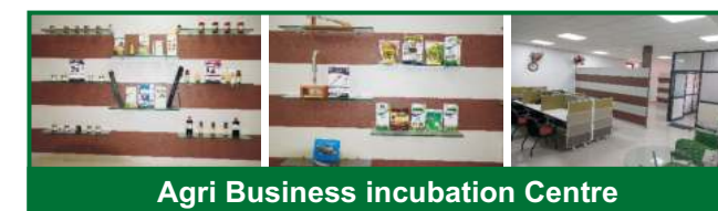
Agri Business incubation Centre