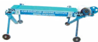
Quatro Sugarcane Single Bud Cutter