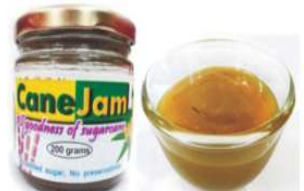
Cane Jam Production