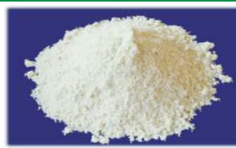
Production of Spray Dried Sugarcane Juice