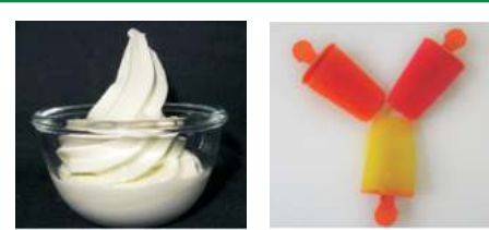
Novel Frozen Sugarcane Juice Products