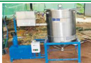
Sett Treatment Device