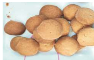
Production of Cane Dietary Fibre Food Products