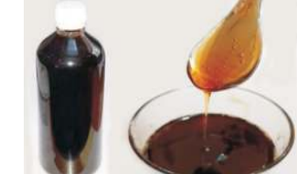
Liquid Jaggery Process