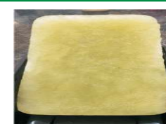
Freeze Preservation of Sugarcane Juice with Natural Additives