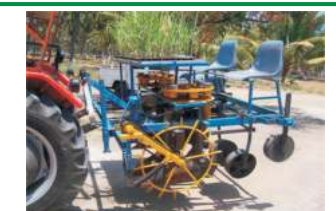
Sugarcane Mechanical Planter