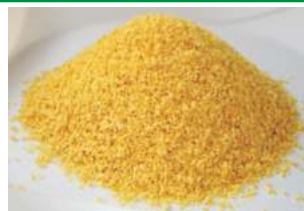
Freeze Dried Sugarcane Juice