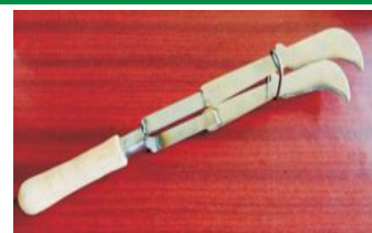
Sugarcane Detrashing Tool