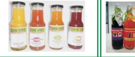
Production of Sugarcane Wine with Different Fruit Blends