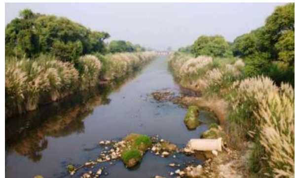
Figure 4. Saccharum spontaneum in canal bunds

Altitudinal gradients can negatively affect plant distribution and limit plant growth and reproduction. In natural environments, plants must overcome many abiotic stresses, such as drought, salt, cold, ultraviolet radiation (UV) and altitude, to complete their life cycles (Ahmad et al. 2018). Altitudinal gradients cause the climate and environment to differ greatly within a short