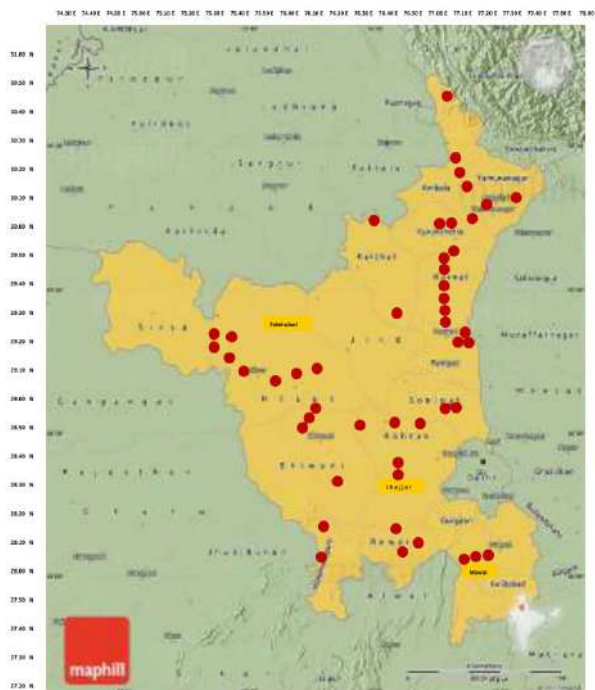
Figure 2. Map showing Saccharum spontaneum collection sites (pink and blue dots) in Chandigarh and Punjab

197 m MSL (IND 16-1828) to 682 m MSL (IND 16-1815) and mostly occur as small population and individual clumps (Fig. 2).