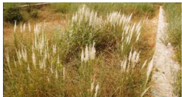
Figure 3. S. spontaneum (IND 16-1759), early flowering collection

High variability was observed among the collection form Punjab state for various quantitative characters. While plant height varied between 46 cm (IND 16-1813) and 450 cm (IND 16-1809), arrow length ranged from 14 cm IND 16-1839) to 66 cm (IND 16-1809). Leaf width varied greatly from 0.1 cm (in 9 clones - IND 16-1807, IND 16-1808, IND 16-1812, IND 16-