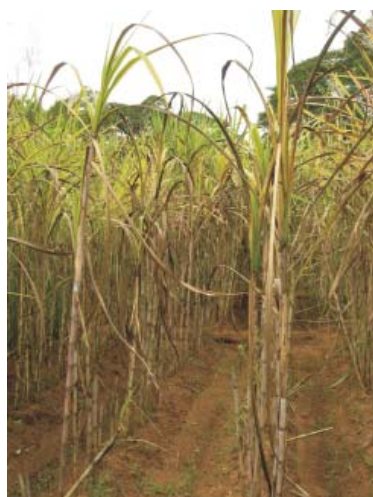
Fig. 7b. Extensive loss to cane stand due to wilt (dead canes are cut-off at nodes to show remaining few internodes)

no association with other biotic agents in aggravating wilt infection. Wilted canes never recovered and that led to extensive foliage drying. In severe cases, dried canes showed cut-off symptoms at nodes (Fig. 7a,b). Occasionally the wilt-infected canes of cv Co 86032 remained partially turgid with discoloured foliage till harvest. In such plants, the crown remained green and other leaves showed prominent yellowing/drying. Leaves of many wilt-infected plants exhibited a distinct pinkish red or pinkish purple discoloration on yellow background (Fig. 8).