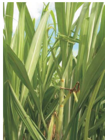
Fig. 2. Pokkah boeng infected sugarcane plant showing recovery of symptoms in newly emerging spindle leaves