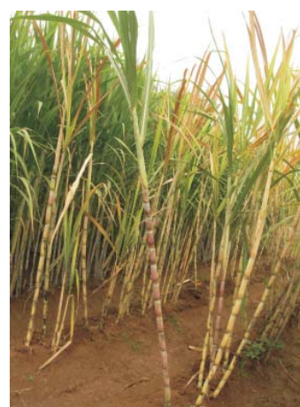
Fig. 6a. Sugarcane cv Co 86002 exhibiting severe wilt with typical rind paleness and cane drying in the field (healthy canes with vigorous growth seen in the foreground)

were conspicuous due to stunted growth, paleness and withering/ drying of the canes in a background of healthy canes / resistant varieties. The varieties such as Co 86002, Co 89003 and C79218 exhibited typical wilt and ~80% of the canes of Co 86002 and C79218 showed wilt with typical paleness of rind, pith formation/discolouration inside the canes (Fig. 6a, b). All the affected canes showed death of spindle in these varieties. Although Co 89003