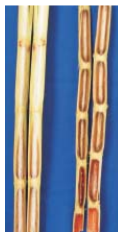
Fig. 6b. Internal symptoms of wilt affected sugarcane exhibiting tissue discoloration and cavity formation