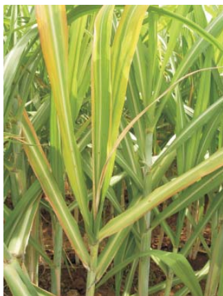
Fig. 5. Top rot affected clones showing death of emerging leaves inside the crown and forming a whip-like dried spindle

The acute phase of the disease resulted in top rot phase, which was characterized by rotting of growing point / spindle leaves. Most of the PB-infected canes generally recovered from the symptoms, but top rot phase never recovered from the damage. Top rot phase was an intriguing phase in PB/wilt epidemiology in sugarcane. Many of the top rot affected clones showed death of emerging leaves inside the crown and formed a whip-like dried spindle (Fig.5). Sometimes partial blight symptoms