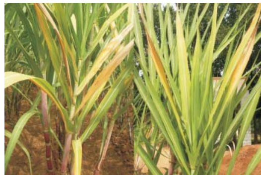
Fig. 9. Reproduction of partial symptoms of pokkah boeng in CoC 671 showing typical yellowing of leaves in the crown after pathogen inoculation by whorl method. Left: field symptoms; right: induced symptoms

When Fusarium isolates from affected leaves of Co 8371 and Co 99004 were inoculated on canes of CoC 671 by whorl method, typical yellowing of leaves in the crown was observed as in the field (Fig. 9). Unlike in the field conditions we did not observe typical PB symptoms of the disease.