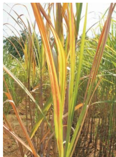
Fig. 8. Distinct pinkish red discoloration of lamina tissue in wilt-affected canes

no association with other biotic agents in aggravating wilt infection. Wilted canes never recovered and that led to extensive foliage drying. In severe cases, dried canes showed cut-off symptoms at nodes (Fig. 7a,b). Occasionally the wilt-infected canes of cv Co 86032 remained partially turgid with discoloured foliage till harvest. In such plants, the crown remained green and other leaves showed prominent yellowing/drying. Leaves of many wilt-infected plants exhibited a distinct pinkish red or pinkish purple discoloration on yellow background (Fig. 8).