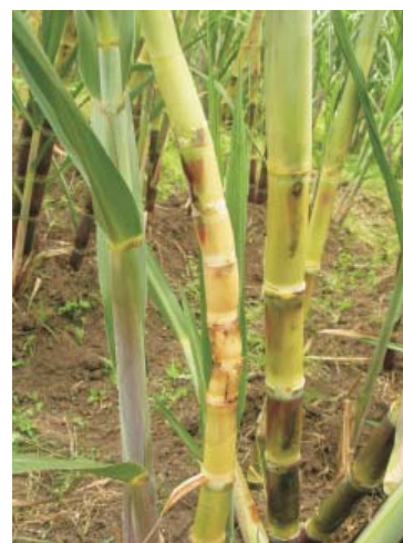
Fig. 4. Impact of pokkah boeng on sugarcane: severe internodal shortening (infected cane seen with a healthy cane in the field)

phenotypic symptoms remained static in tolerant varieties but in susceptible varieties severely necrotized leaves showed paleness, yellowing and drying. Due to severe PB infection, internodal elongation was drastically reduced in the affected stalk region. Depending on the severity of PB, up to five or six internodes showed shortened internodes (Fig. 4). However, in a variety like Co 8371, axillary