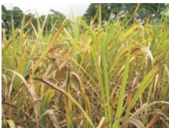
Fig. 7a. Severely wilt affected clone exhibiting extensive foliage discoloration and drying

showed typical wilt, it was not severe as in the other two varieties. Initially, drying or chlorotic discoloration of the youngest leaf in the whorl occurred and unlike top rot, there was no rotting of spindle tissues found in case of wilt. In the affected canes, the weakened spindle did not grow further and without new leaves, the canes became stunted with withering of leaves. The wilted canes were free from root borer infestation and this indicated