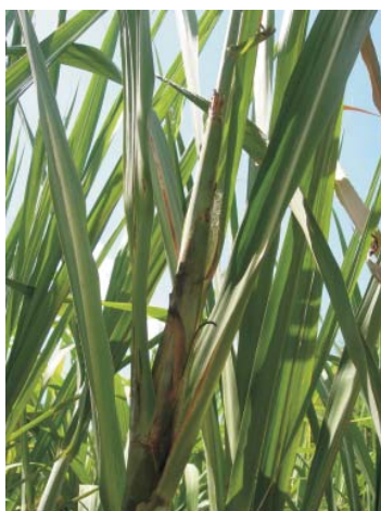
Fig. 3. Severe pokkah boeng infected plant showing severe malformed leaves