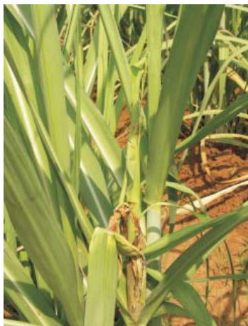
Fig. 1. Typical twisted top with varying levels of leaf deformities in pokkah boeng affected sugarcane