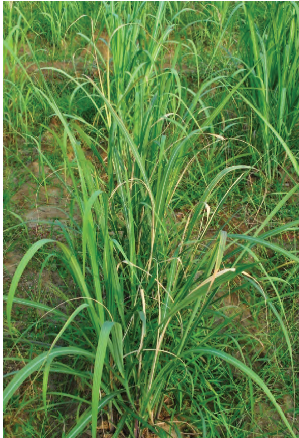
Figure 1. Deadhearts in young sugarcane crop caused by shoot borer

1954; Doss 1956). In severe cases of infestation, the damage due to the borer could be as much as 90% (Prasada Rao et al. 1991).